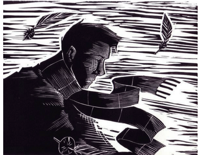
Azraelengel, Disappointment , 2014.

Linoleum cut 8x10 block black and white print on Lennox.