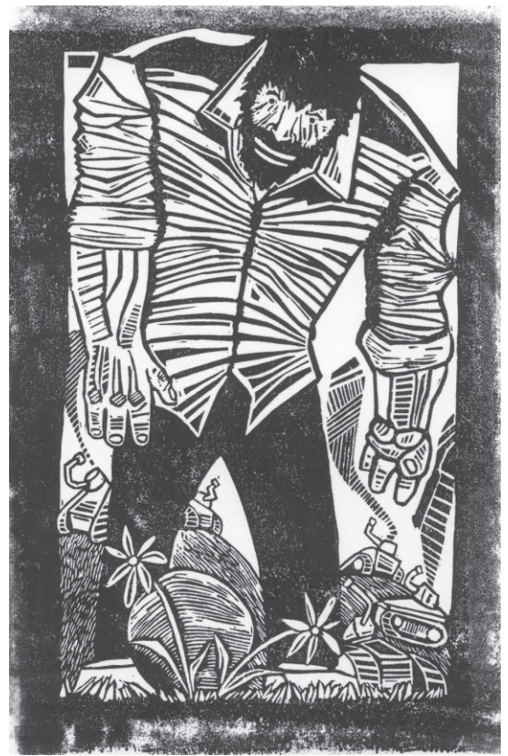
Owen Linders, Ethan can crush everything from tanks to daisies , 2010.