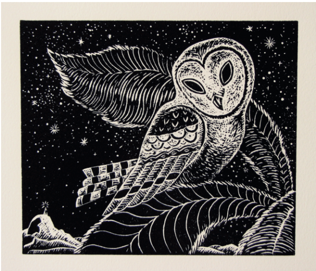
Mike Schultz, Ghost Owl and Tower , 2009.

Linoleum cut 8x10 block black and white print on Lennox.